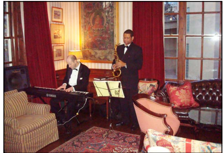
Guests enjoyed live music