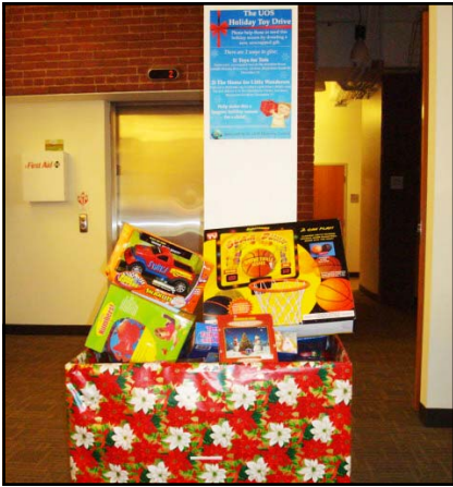
Toys overflow from one of the collection bins inside Blackstone South

The Toy Drive is organized by the UOS Diversity Council, which for more than ten years has been fostering respect, improving understanding, creating camaraderie, and helping others. Thank you to all who participated.