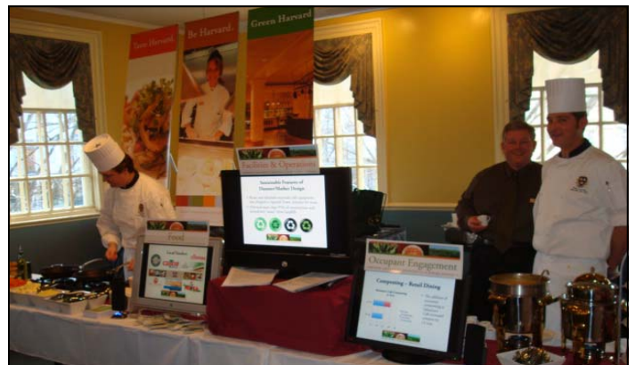
Dining Services provided plenty of great food