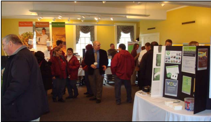
The VPA Green Fair

December 11 was Green Day in VPA. Nearly 200 employees visited the VPA Green Fair held in the Dudley House Common Room. The event showcased how UOS, Harvard Real Estate Services (HRES), Harvard University Dining Services (HUDS), and Harvard Magazine support sustainability. HUDS provided food with locally grown ingredients and HRES showcased their efforts to improve energy efficiency within their buildings. UOS highlighted more than 15 programs and projects including: building energy audits, alternative fuels, efficiency improvements within the Blackstone Steam Plant, and energy saving initiatives within the University’s laboratories. Special thanks to all who participated and attended.