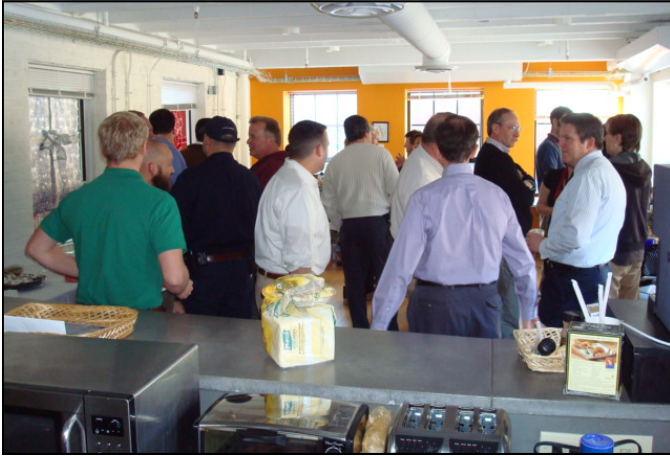
The UOS Holiday Social