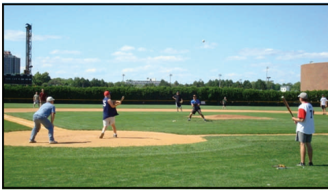
Players take the field!

The weather could not have been better for the 1st Annual UOS Softball Showdown. Nearly two dozen employees gathered on the varsity baseball fields under blue skies and bright sunshine. There were quite a few home runs, close calls, and strikeouts. The games moved rather quickly thanks to the one swing format. Which team won? It's tough to say since the teams did not have names. What's important is that the event built camaraderie among employees who typically don't mix and mingle. That's one of the primary goals of the UOS Diversity Council.